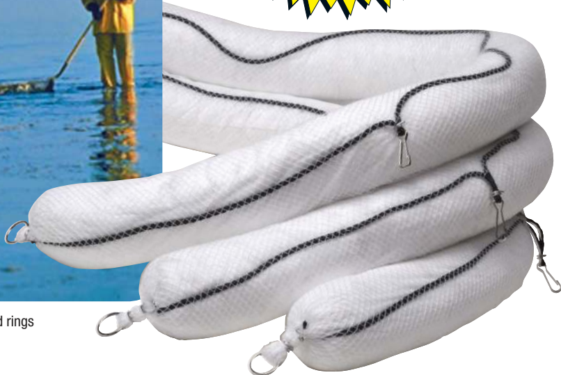
These two men are cleaning a marine spill with numerous booms linked together by their end rings

Highest Quality Synthetic and Polymer Fill!