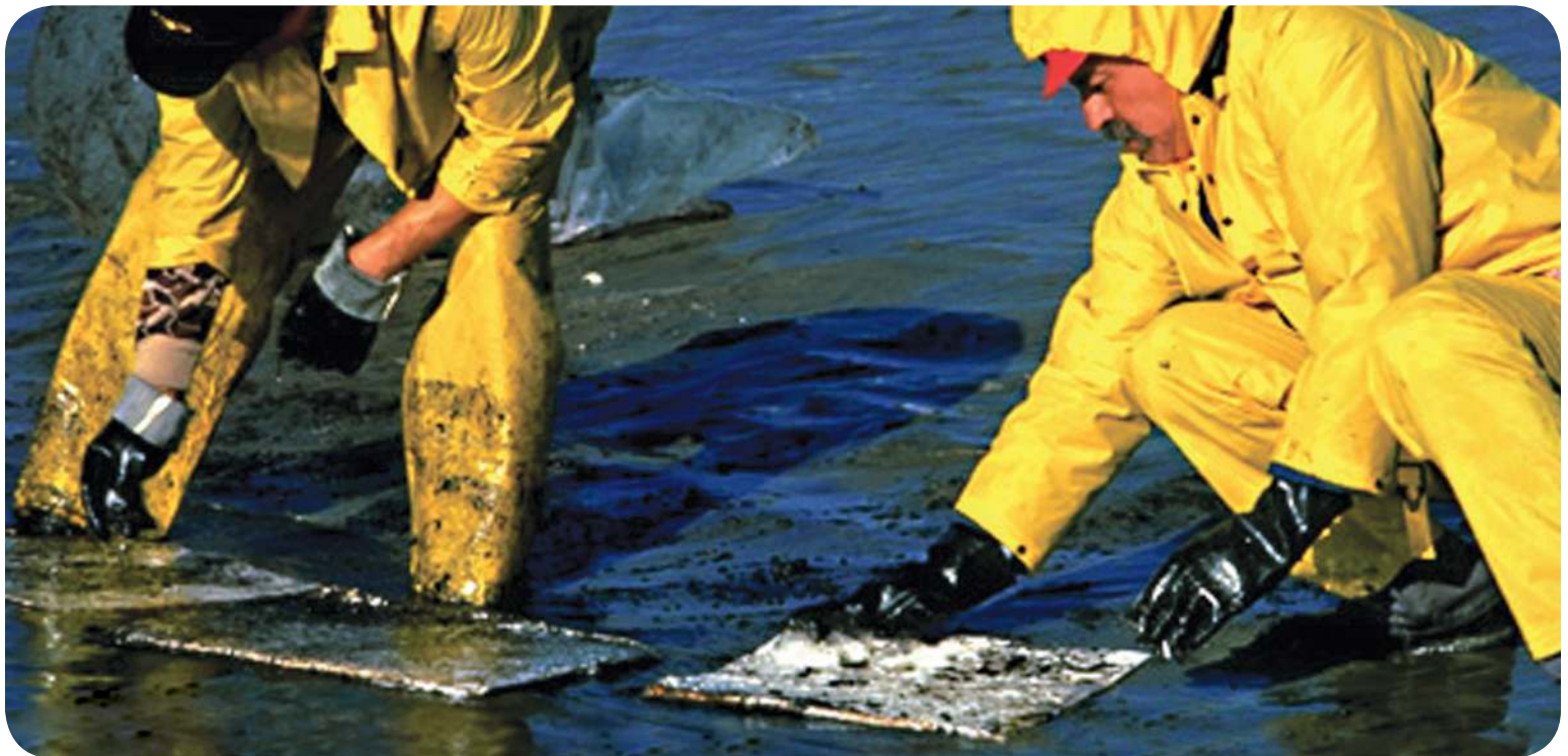
When a hazardous spill occurs much of our marine life is put in danger. Oil only pads provide a safe way to separate the spill from the waters that are the lifeblood of many marine animals.