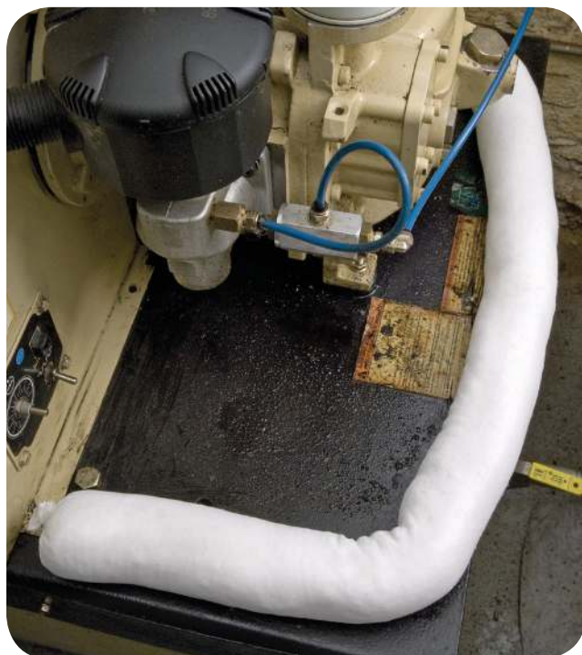
This oil only sock is being used to soak up a small oil leak on a compressor.

Oil Eater® Socks are a great way to isolate small drips or protect drains and floors from runaway spills. All of our socks feature durable knitted sleeves to keep the high quality synthetic and polymer filling safely inside. Available in both white oil only and grey universal styles. Available in 3" diameters with 4' lengths.