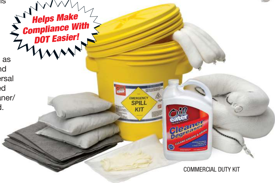
COMMERCIAL DUTY KIT