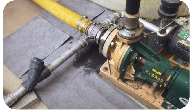
Machinery often leaks in hard to reach places. Our Sonic Bonded pads tear easily along their perforated seam to fit most any space.

Available in light, medium and heavy weights.