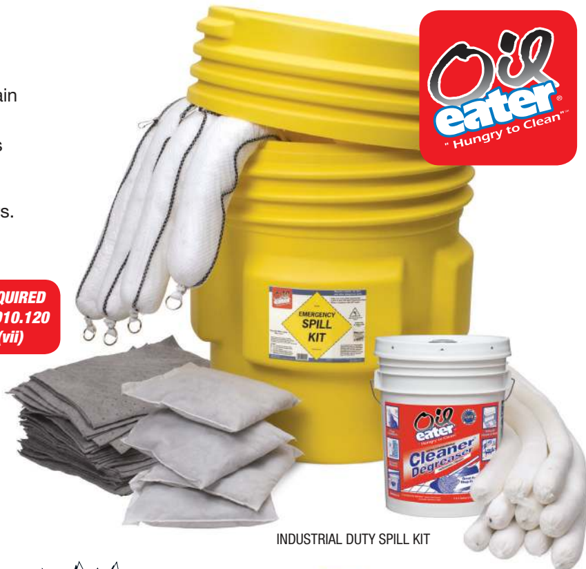
INDUSTRIAL DUTY SPILL KIT

OSHA REQUIRED 29 CFR 1910.120 (j) (i) (vii)