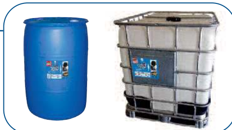
Available in 55 gal. drums or 275 gal. totes.