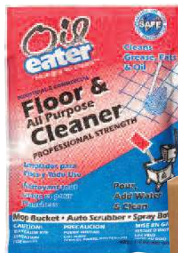
1.5 oz. portion pack (100/case)

AVAILABLE IN PRE-MEASURED PACKETS OR IN ECONOMY BULK!