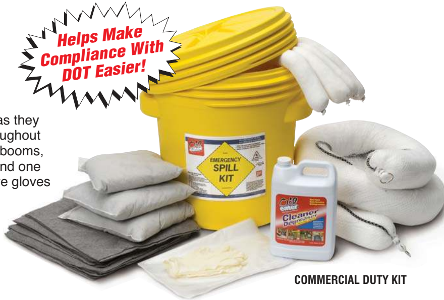
COMMERCIAL DUTY KIT