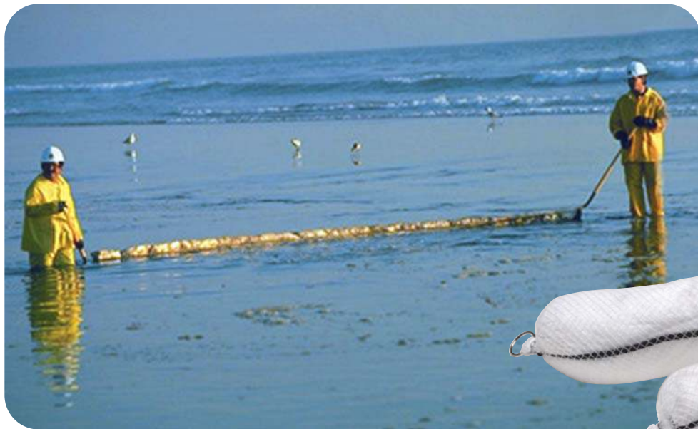
These two men are cleaning a marine spill with numerous booms linked together by their end rings