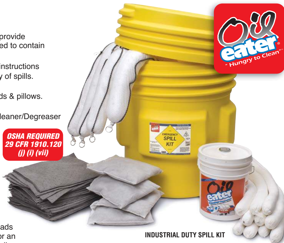
INDUSTRIAL DUTY SPILL KIT

OSHA REQUIRED 29 CFR 1910.120 (j) (i) (vii)