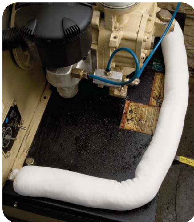
This oil only sock is being use to soak up a small oil leak on a compressor.

Available in 3" diameters with 4' lengths.