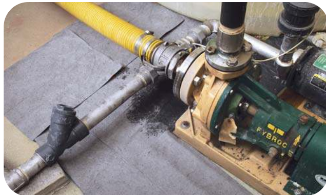
Machinery often leaks in hard to reach places. Our Sonic Bonded pads tear easily along their perforated seam to fit most any space.