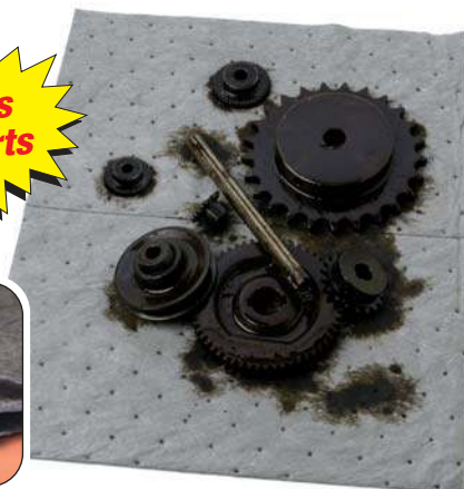
Small diameter densely woven outer layers of our Fine Fiber pads keep lint away from internal parts while the high loft meltblown core pulls in oils and other fluids.