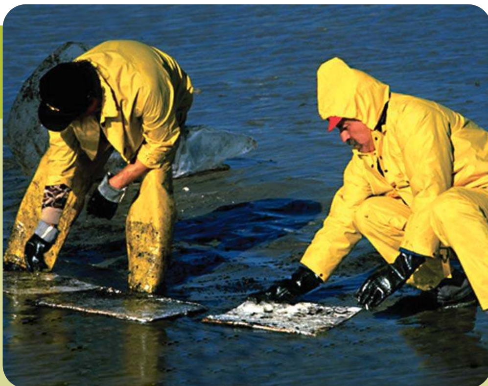
When a hazardous spill occurs much of our marine life is put in danger. Oil only pads provide a safe way to separate the spill from the waters that are the lifeblood of many marine animals.