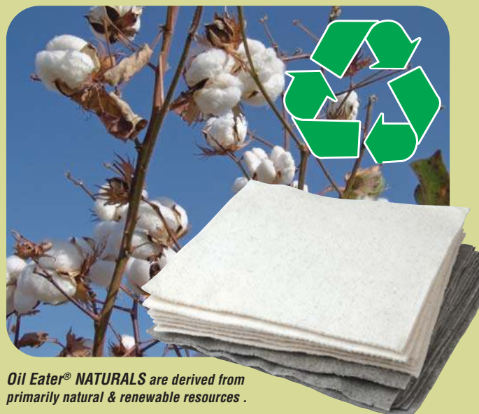
Oil Eater® NATURALS are derived from primarily natural & renewable resources.

Oil Eater® NATURALS are better for the environment. NATURALS are made using renewable resources and the manufacturing process uses much less energy.